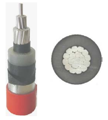
Fig.2: Special care is taken with accessories and optimised design cable

The engineer has to define an acceptance level of interoperability. This level influences the range of accessories (with a possible extra cost).