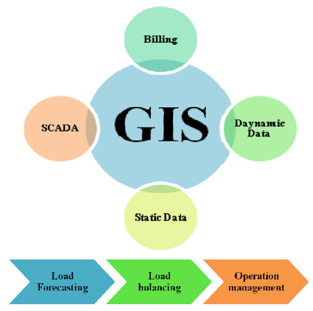
Fig. 1. GIS and other datababses

One of the important databases is billing. Energy consumption of customers is integrated in this database. This database has information of customer such as number of phase and consumption history of customers. The location of each customer determines in GIS software and linked to billing by unique cod. Due to existence consumption of each customer and kind of customer, the ability to network analysis is provided [4].