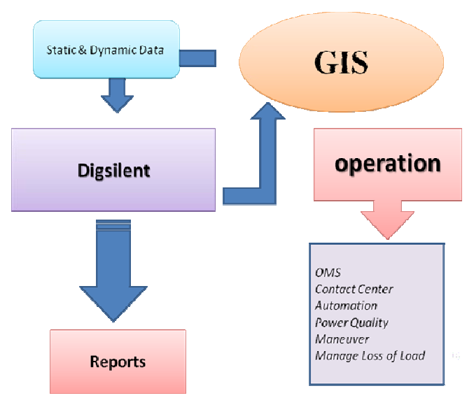
Fig. 2. Interface between GIS and Digsilent for operation

By this way, always existence update network in GIS and Digsilent.