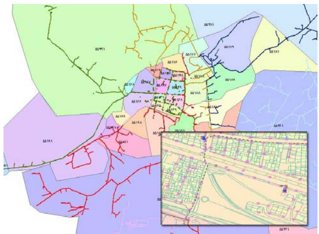
Fig. 3. Case study on GIS platform

these dataset in case study area. For example by this ability can determine that in top of the view, only show middle voltage equipment and city map dataset.