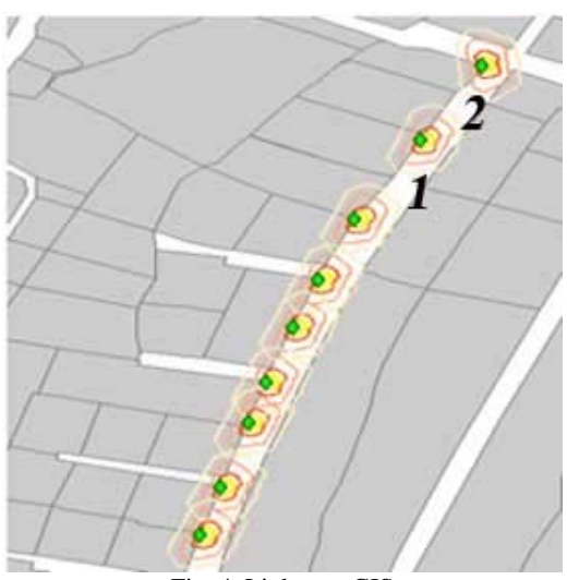
Fig. 4. Lights on GIS

Dependent on environmental conditions. Also preventive maintenance (PM) has impact in this issue that GIS software is used for preventive maintenance. So can be used GIS for evaluation of system's reliability with WM model (Weibull-Markov) [7, 8]. Fig. 5 shows this issue (With details).