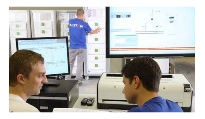
Fig. 5 - Digital Control Systems: the marriage of state-of-the-art software and intelligent electronic devices

Wide area control units (WACU) offer the possibility to exchange IEC 61850 GOOSE data between voltage levels within a substation and also between neighbouring substations.