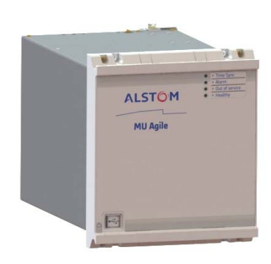
Fig. 3 - Example merging unit

Digital controllers (SCU - switch control units) are the fast, real-time interface to switchgear, mounted close to the plant which they command. They replace hardwiring of inputs/outputs by an Ethernet interface to the yard.