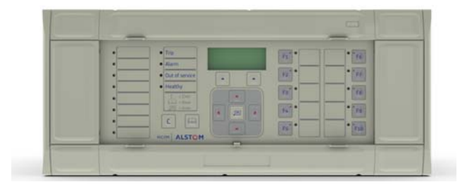
Fig. 4 - Example process bus protection relay

The authors' company's IEDs extend their supervision facilities to include comprehensive addressing and plausibility checking of the incoming sampled values from the process bus. This addresses the fact that the traditional task of current and voltage sampling is now external to the device, and is connected via Ethernet. This ensures maximum security, dependability and speed of the protection scheme.