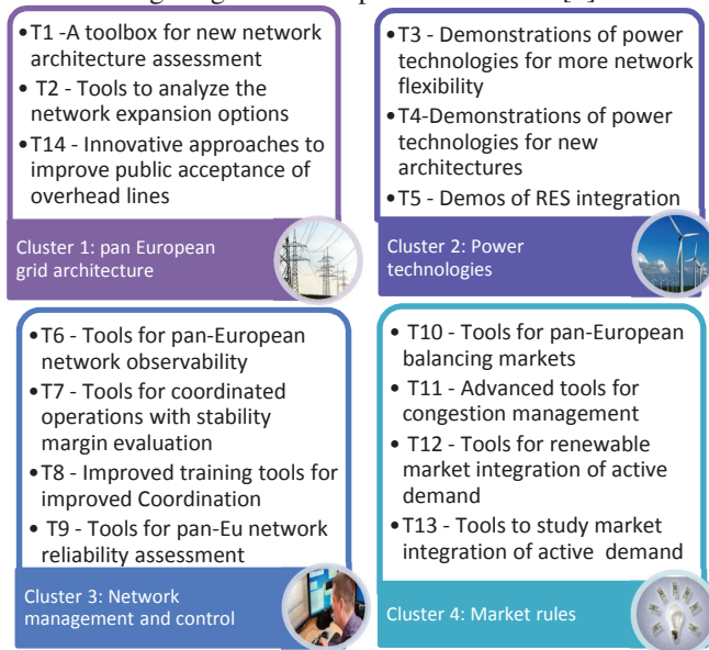
Figure 1 – EEGI structure for the analysis of Tn projects

The EEGI roadmap classified the RD&D activities in a hierarchy of clusters and functional projects, for both transmission (TSO) and Distribution System Operators (DSO) (Figure 1 and Figure 3, where Tn and Dn are the projects related to transmission and distribution, respectively). A cluster is a set of functional projects dealing with common issues that need to be managed all together to avoid overlaps and guarantee the complete coverage of these issues. A functional project (FP) is a description or definition of demonstration and/or research activities needed to reach specific functional goals, and includes budget figures and expected outcomes [3].