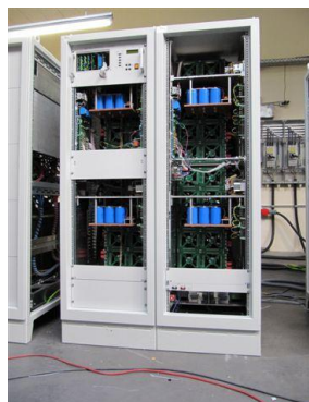
Fig. 4: single power stage of the three phase 240 KVA supply