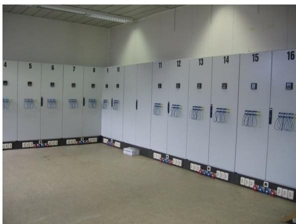
Fig. 5: general overview of the actual test facility