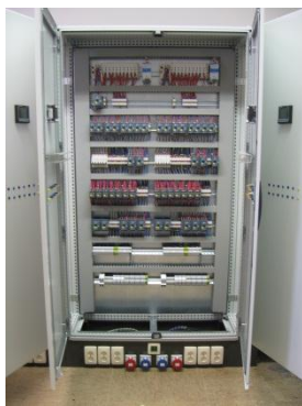
Fig. 3: electrical cabinet

At the moment of publication, the proposed test facility is already in its testing phase. Each cabinet presented in Fig. 3 represents 2 POCs. In Fig. 5 the practical demonstrator is being illustrated.