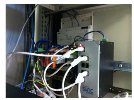
Figure 4 – Equipment installed for the demonstration project

Communication with ABB Protection Relays (3x REL511 and 3 x SPAJ140C) was performed via SPA Bus Protocol and used a serial port of SYNC2000 (SPA Bus Master) for this purpose. Following features were successfully implemented / tested: