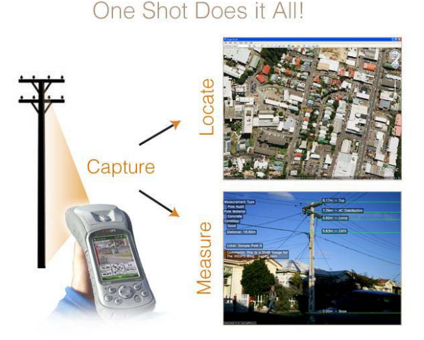
Figure 1. ikeGPS and TrueSize Data Capture

The development of TrueSize imagery and data capture builds on the measurement capability of ikeGPS; an integrated 300m laser rangefinder, sub-metre GPS, 3D compass, digital camera and customisable Windows Mobile software within a single, rugged handheld platform.