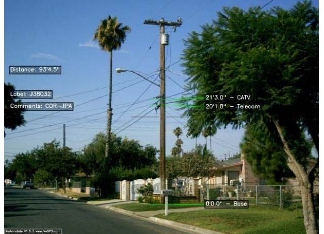
Figure 2. Annotating TrueSize Images

ikeSolutions Poles provides efficient data capture and accurate measurements, along with a digital, photoverifiable record for each pole and the related joint attachments. Pictures and associated data are captured together and are therefore viewed and managed from one source.